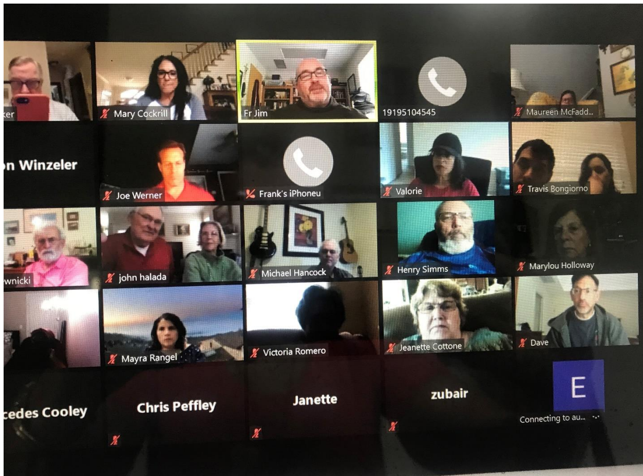
A snapshot of the fraternity meeting, done via Zoom, on May 31.